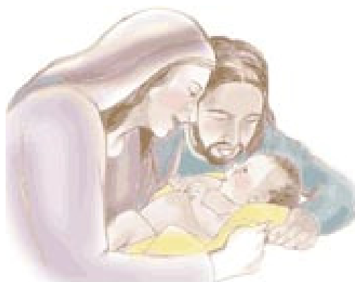
The Miracle of Christmas

By the way, you do not need my permission to avail yourself of Gerhardt's complete Advent text. Read it. Ponder it. Sing it in a joyful noise. Blessed Advent!